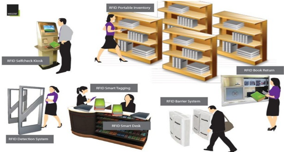
Figure: 2 Library Management Using RFID Technology<sup>8</sup>

The RFID technology works through flexible, paper-thin RFID tags, which can be placed inside the cover of each and every document. Complete information about each document is entered into the Library Management Software. Whenever a user brings a document for issue-return purpose, the RFID reader from the tag reads the information pertaining to that book and transmits the data into the software and document is issued in a few seconds without the assistance of the library staff. As the user takes the document outside the library, the antenna placed at the exit gate automatically reads the information contained on the RFID tag to verify whether the document is properly issued or not. In case, it is not issued to the user as per library norms or it is being stolen from the library, the antenna senses it and gives an instant alert. Thus, it results in successful theft reduction of documents. RFID technology is not only being used for circulation purpose in the libraries, it is also used for stock taking purpose.<sup>7</sup>